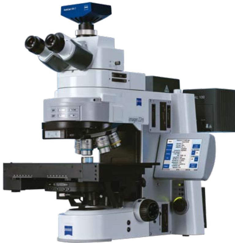
Axio Imager 2 shown with optional AxioCam camera touch screen display.